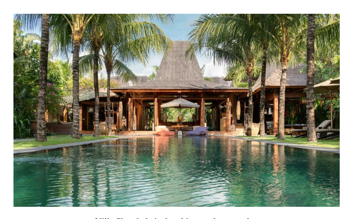
Villa Shambala is the ultimate place to relax

If you are looking for a plush pad to host an epic beachfront wedding, an intimate birthday party, or you are looking for a luxe tropical escape, then read on! These fabulous Seminyak villas provide luxurious living, right in the mix of this exciting and bustling town. Only a short stroll to the sandy beach, minutes from hordes of boutique shops, with world-class restaurants and cafes on your doorstep, these villas are the perfect place to spend your holiday. Choosing which one is the only hard part!