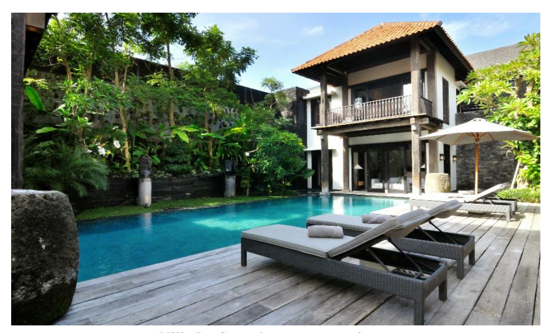
Villa De Suma has a great pool area