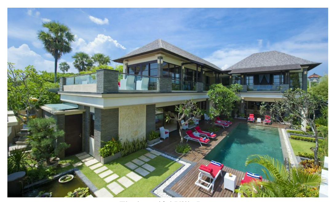
The beautiful Villa Lega