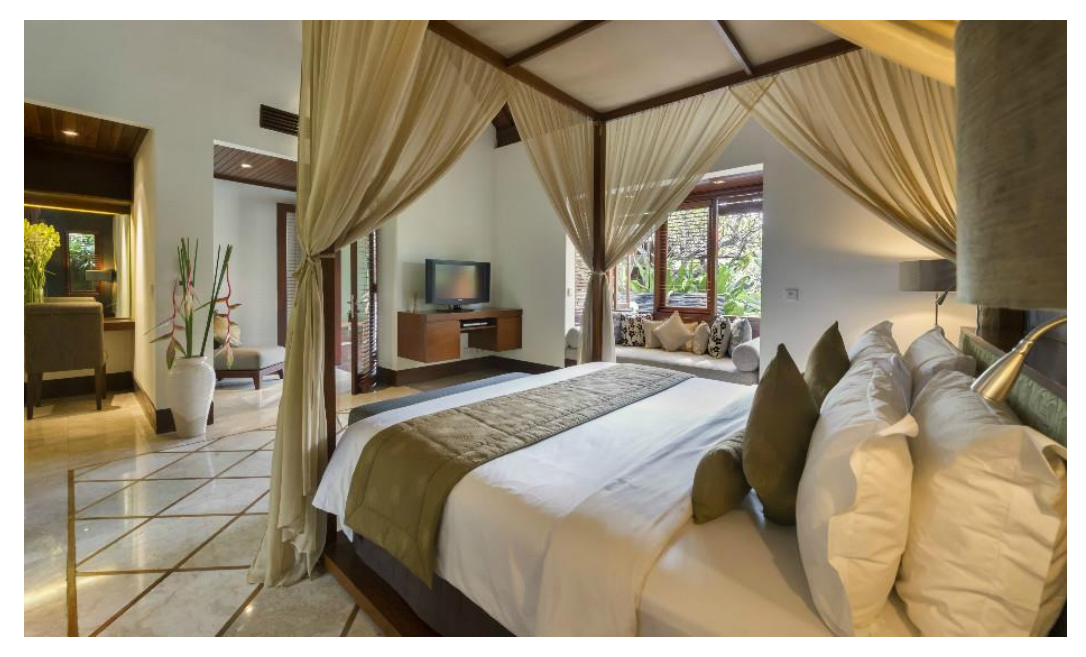
The gorgeous four poster bed