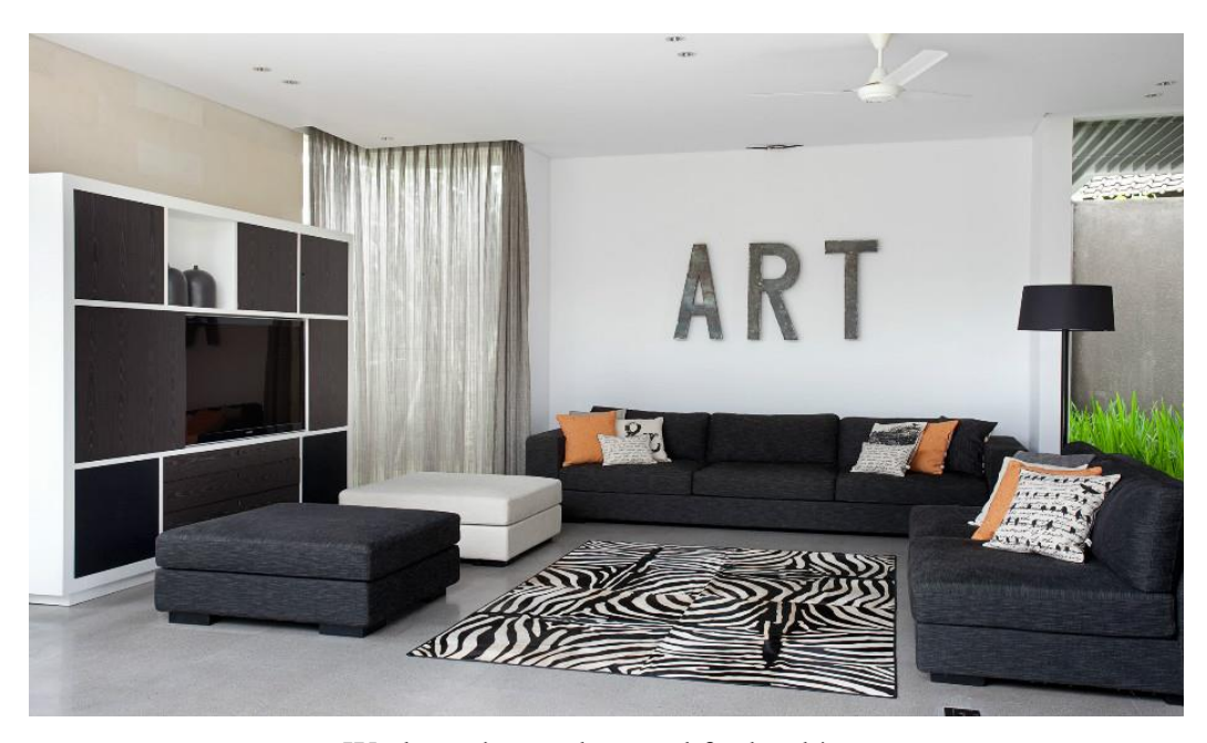
We love the modern and funky décor