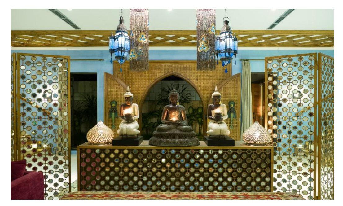
The stunning buddha decorations