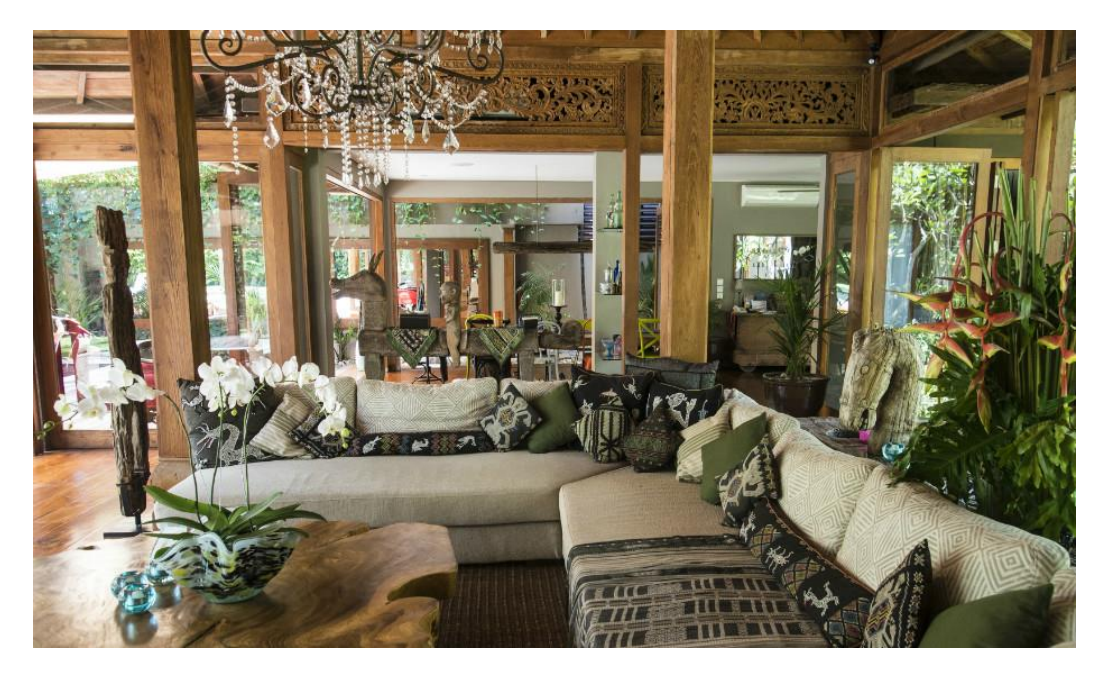
The villa has stunning interiors