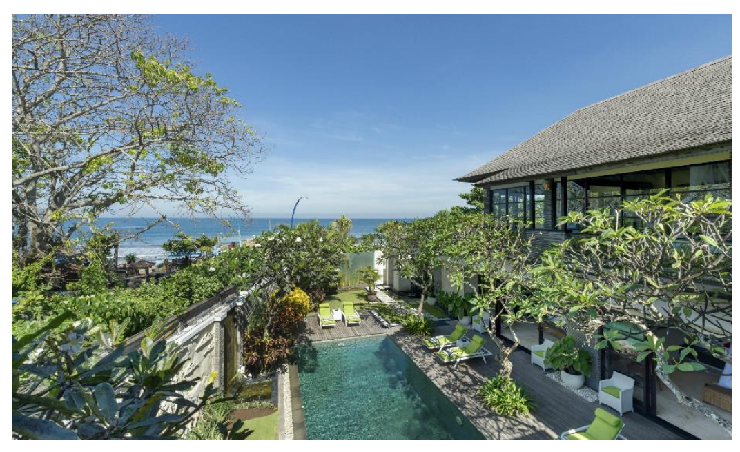
The ocean view