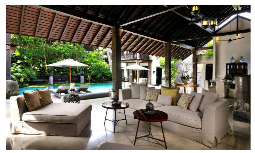
The open living room area