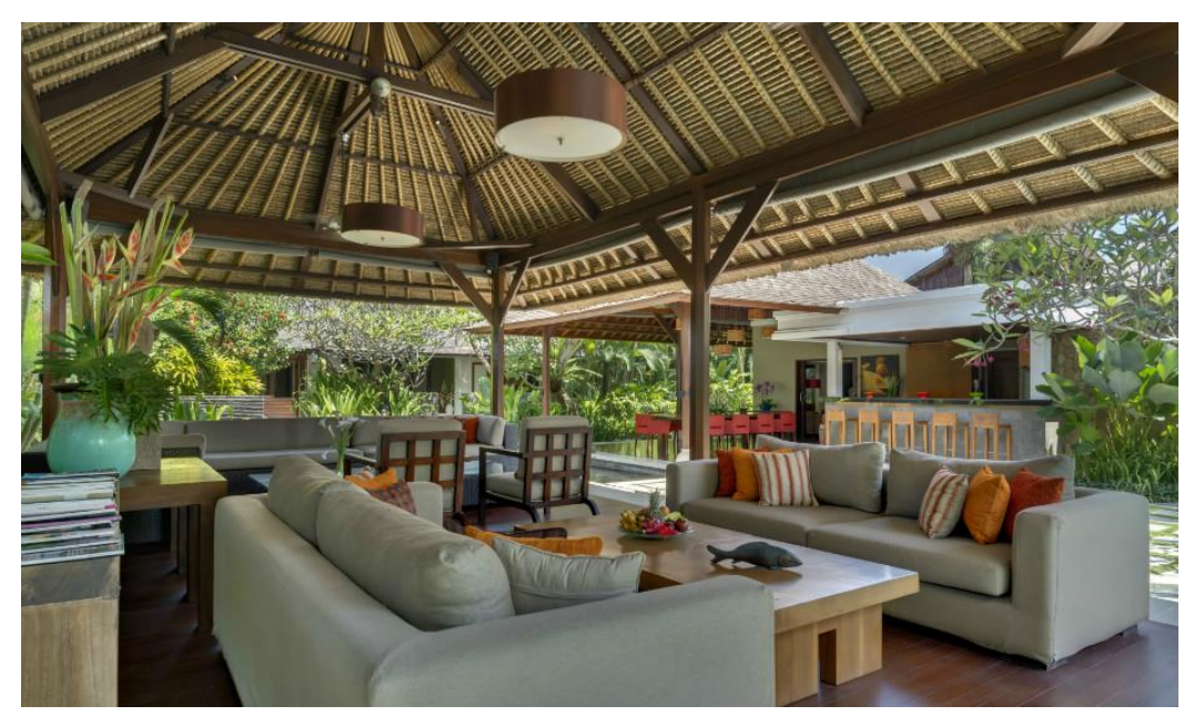
The living area of Villa Asta

Villa Satria, Jalan Petitenget 1000X, Seminyak. p. +62 (0) 361 737 498.