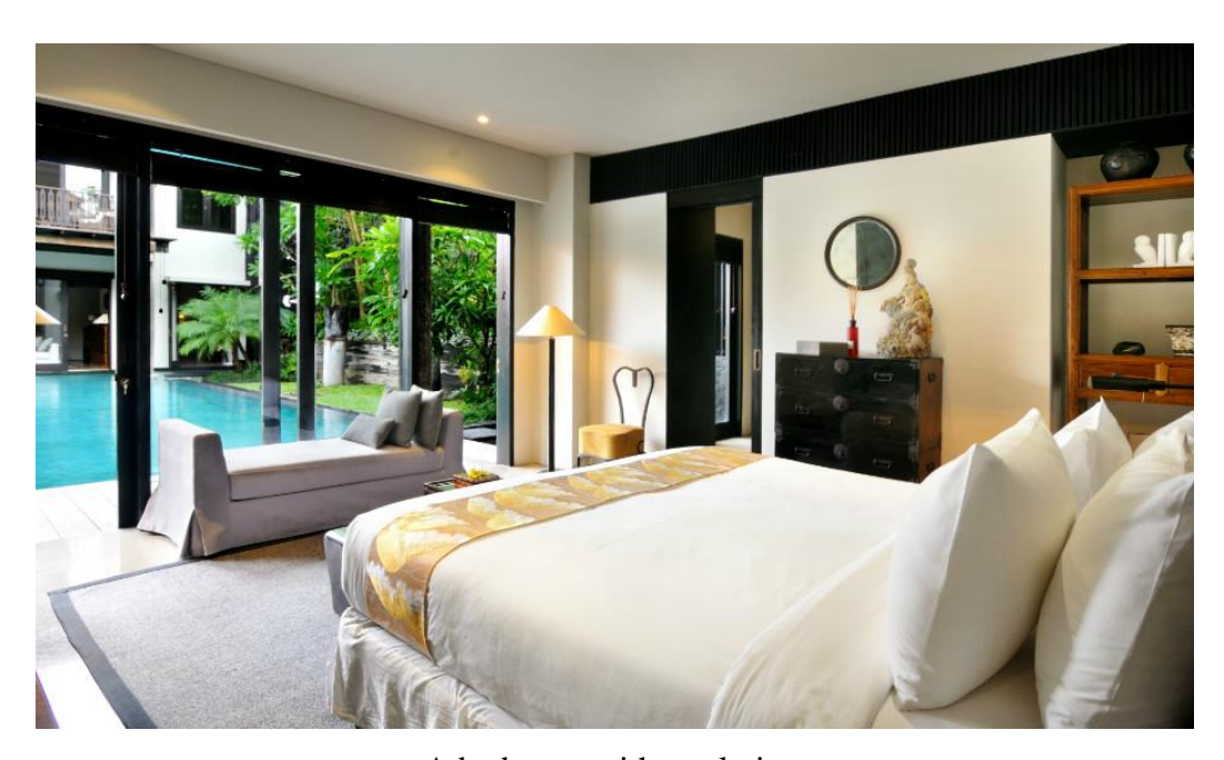
A bedroom with pool view