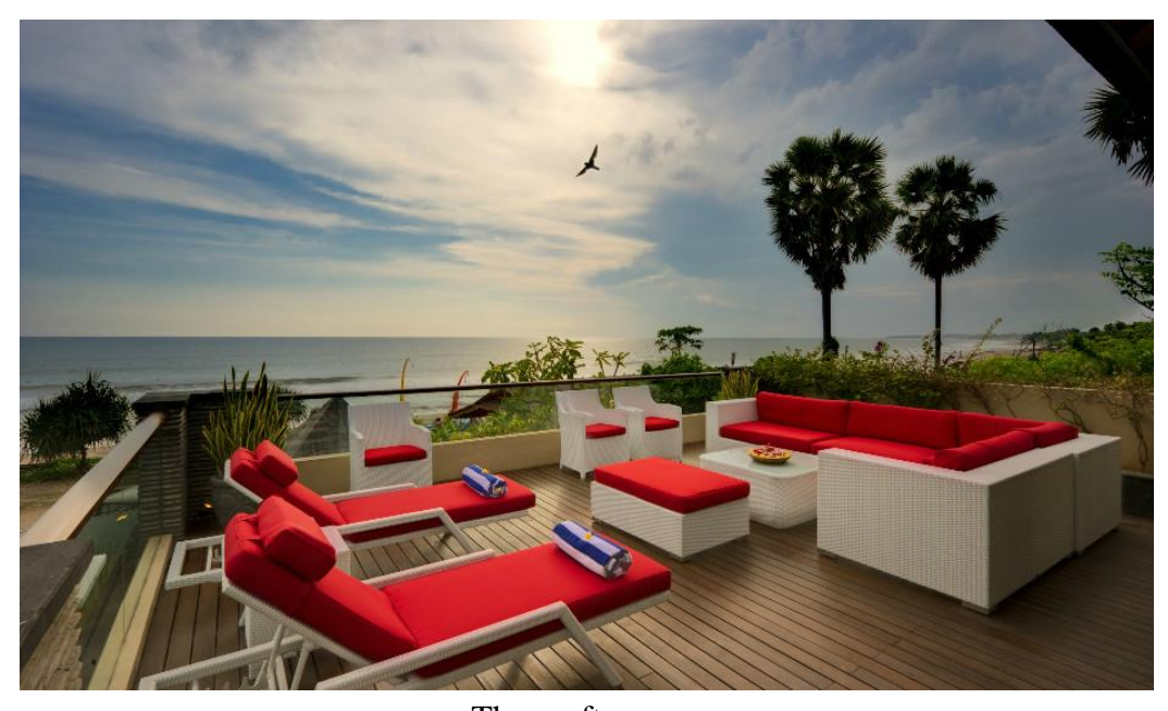
The rooftop area