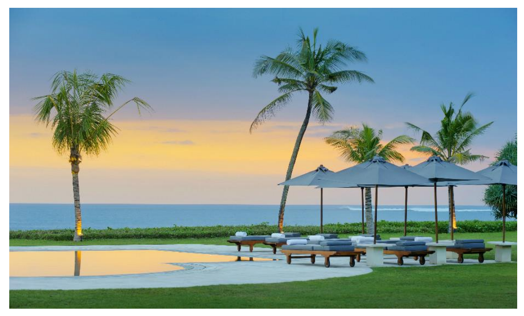
The pool area as the sun goes down