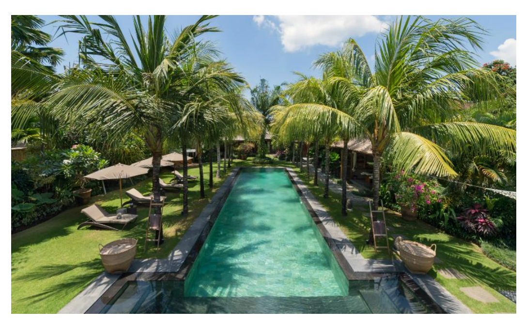
The long azure pool