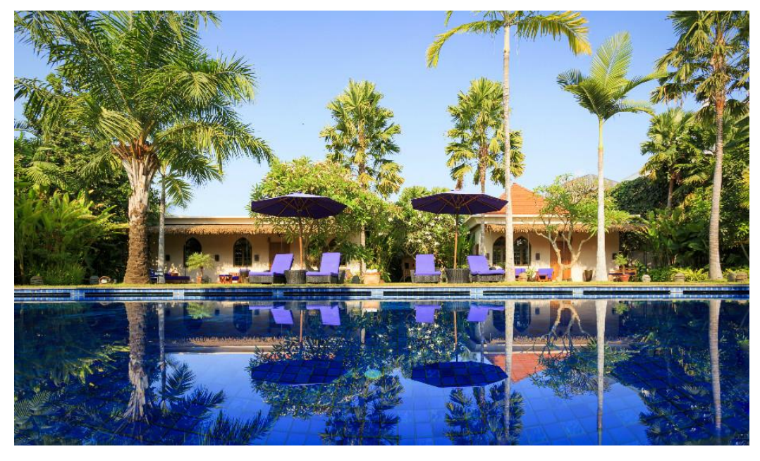
The beautiful pool area