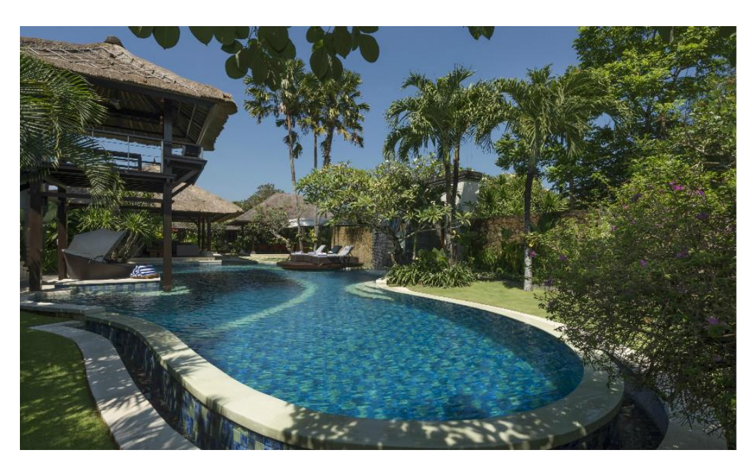
The curved swimming pool