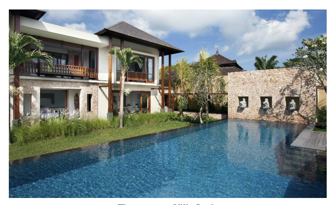
The gorgeous Villa Satria

Villa Shambala, Jalan Saritemuku No.8E, Gang Kahyangan, Seminyak. p. +62 (0) 361 737 498.