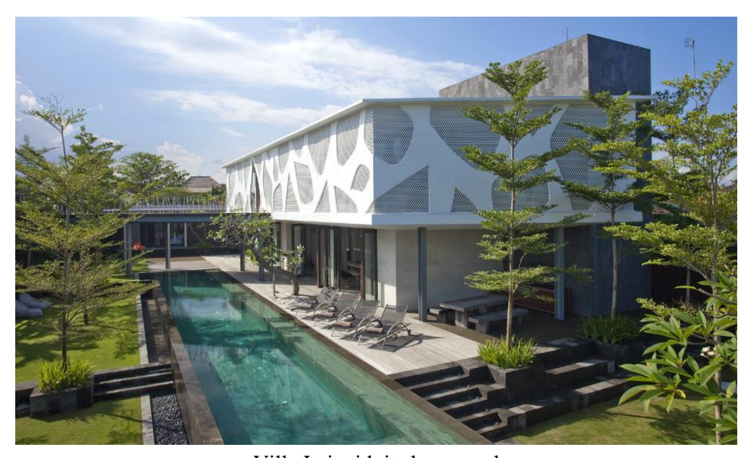
Villa Issi with its large pool