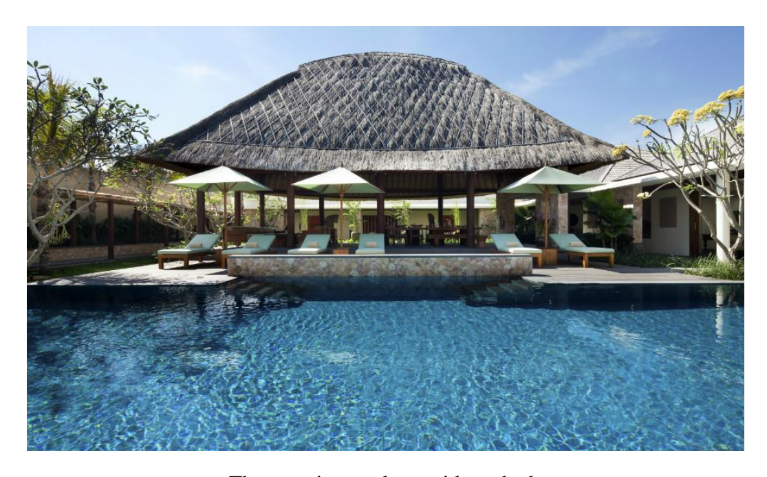
The stunning pool are with sunbeds