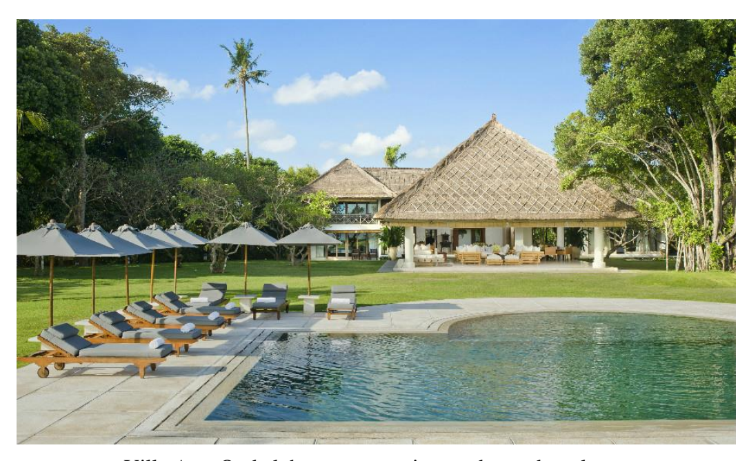
Villa Atas Ombak has an expansive garden and pool area

Villa Asta, Gang Gelatik No.8, Kerobokan. p. +62 (0) 361 737 498.