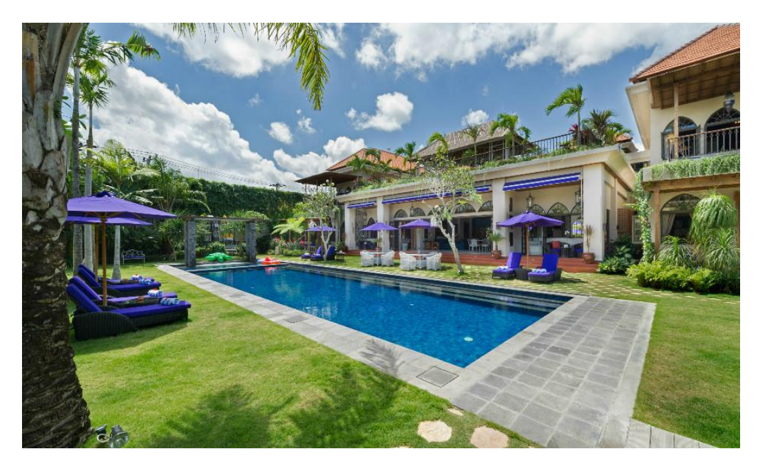
The beautiful Villa Sayang d'amour