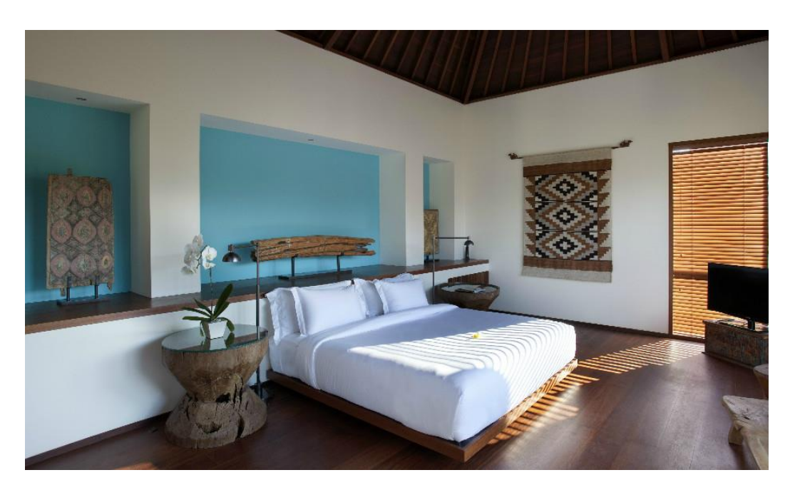
One of the bedrooms